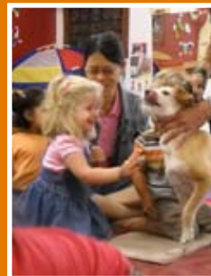
Big vs. Little Dogs