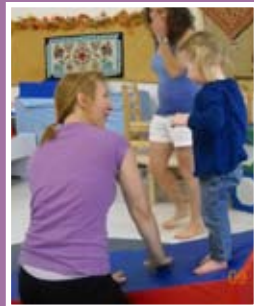
Apex Gymnastics at Creative Minds